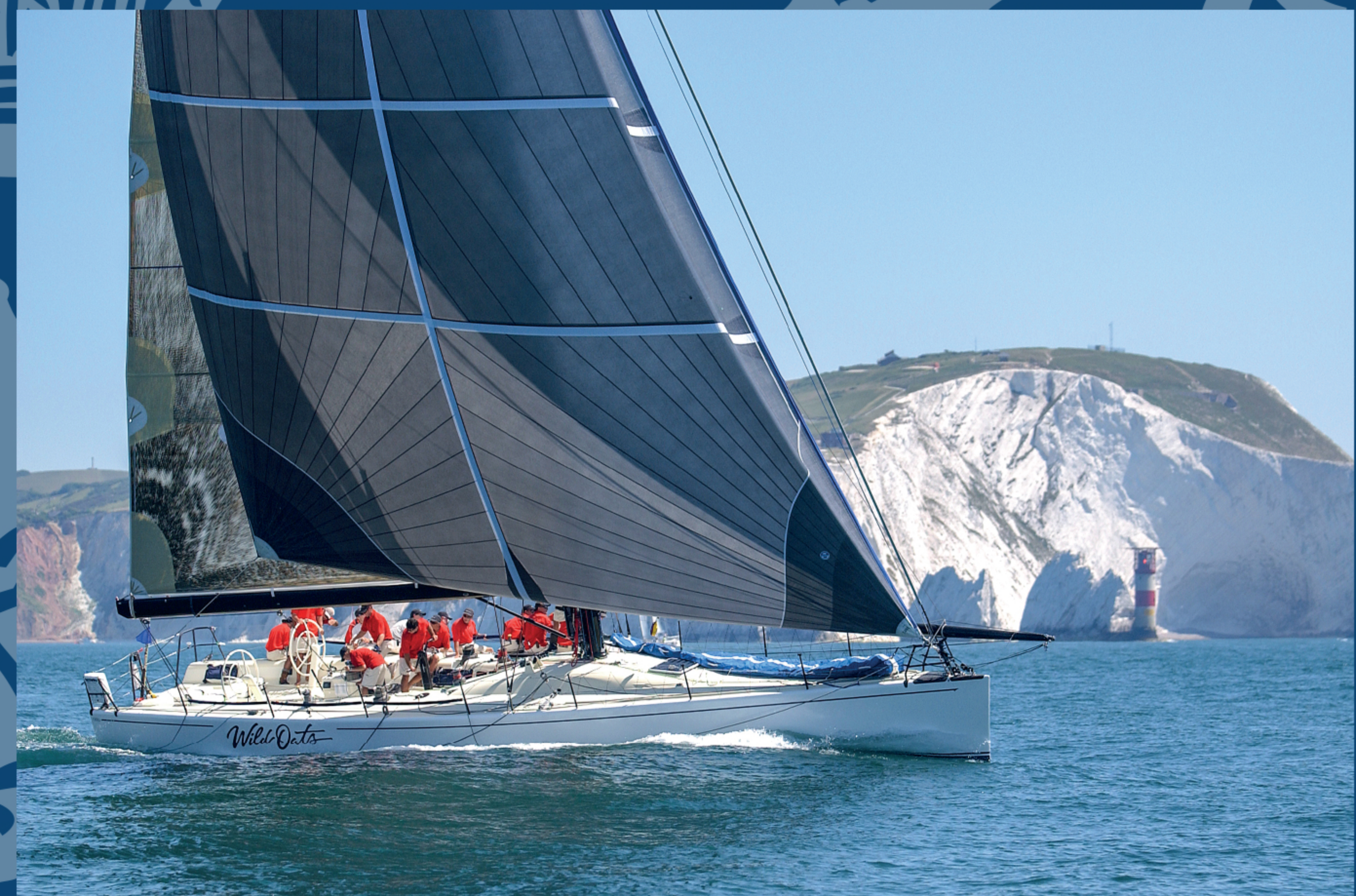
2003: Wild Oats wins Admiral's Cup for Prince Alfred Yacht Club Australia along with team mate Aftershock