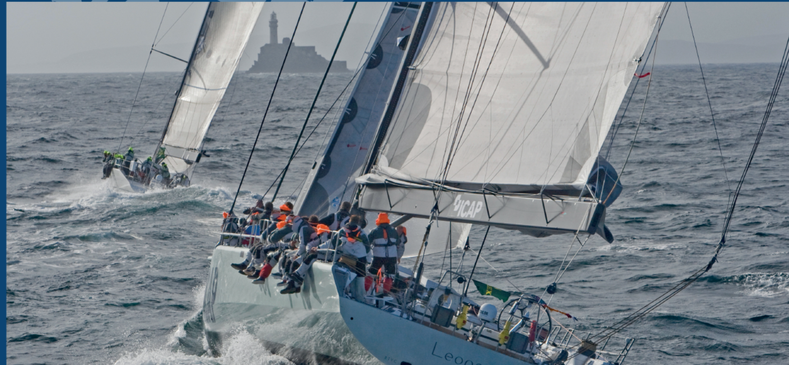
2007 Rolex Fastnet Race: Leopard 3 triumphs in a thrilling duel for monohull line honours with Rambler