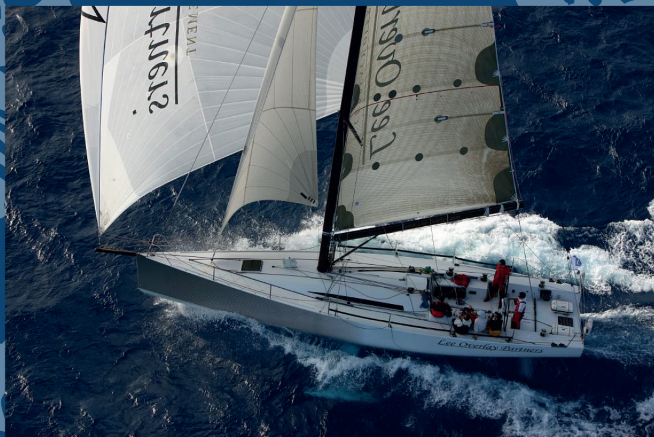
2009 Inaugural RORC Caribbean 600: Overall winner under IRC Cookson 50 Lee Overlay Partners