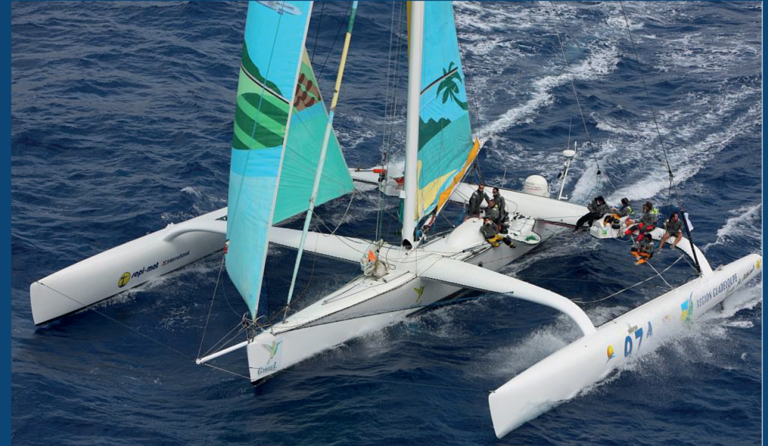
2009 Inaugural RORC Caribbean 600: Multihull Line Honours ORMA 60 Region Guadeloupe

2009 – The RORC Caribbean 600 was held for the first time.